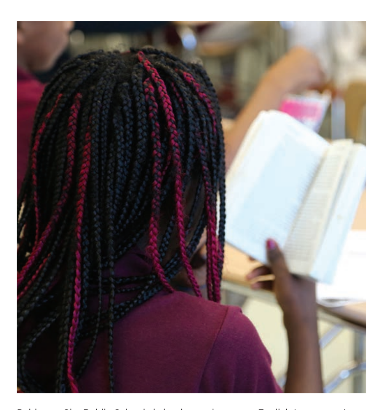
Baltimore City Public Schools is implementing a new English Language Arts curriculum that raises the bar for both rigor and cultural relevance.